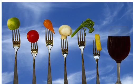
Food & Drink Al Fresco.....8pts Colin Bush