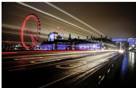
Convergence of Light.....10pts Chris Wooldridge